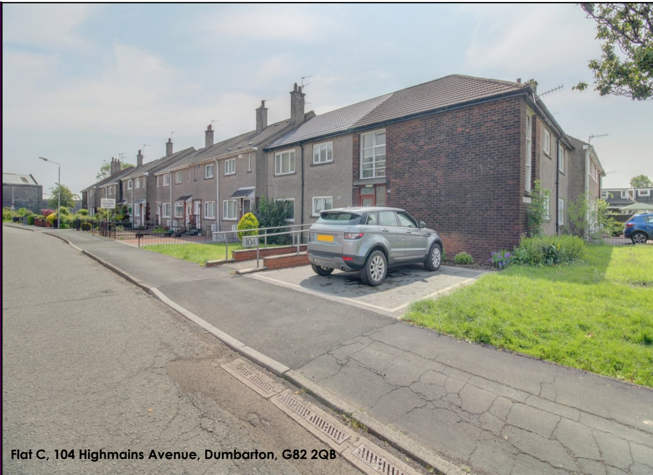
Flat C, 104 Highmains Avenue, Dumbarton, G82 2QB

David Muir Estate Agents offer to the market this immaculately presented first floor one bedroom apartment, which is located in the popular east end of town, where local amenities such as shops, primary schools, children's nurseries and public transport links are within walking distance.