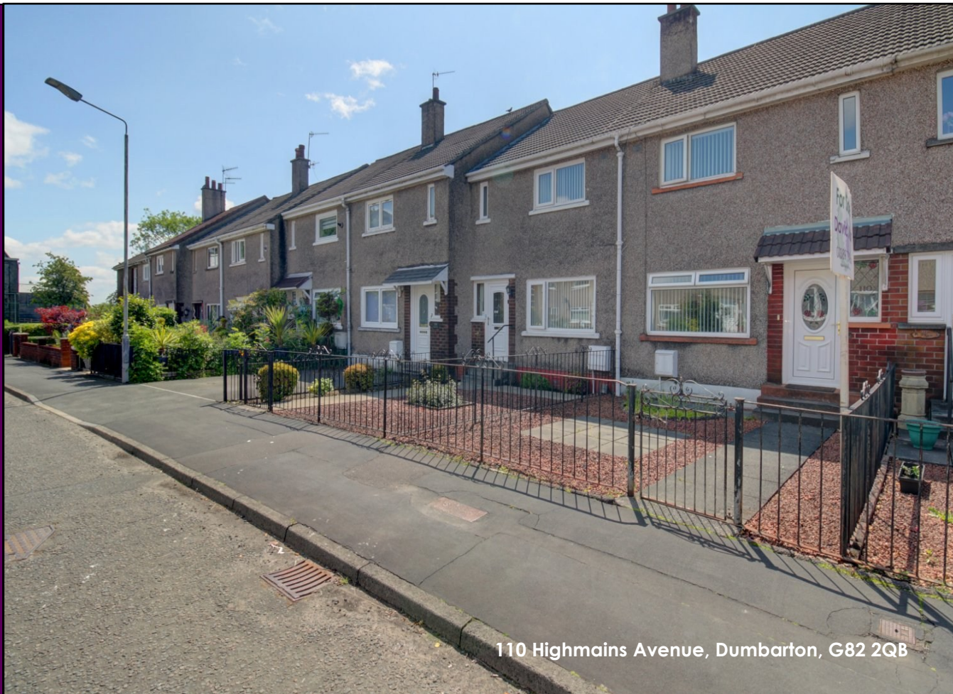
110 Highmains Avenue, Dumbarton, G82 2QB

David Muir Estate Agents present to the market this well presented two-bedroom mid-terrace villa which is conveniently located in this popular east end residential estate.