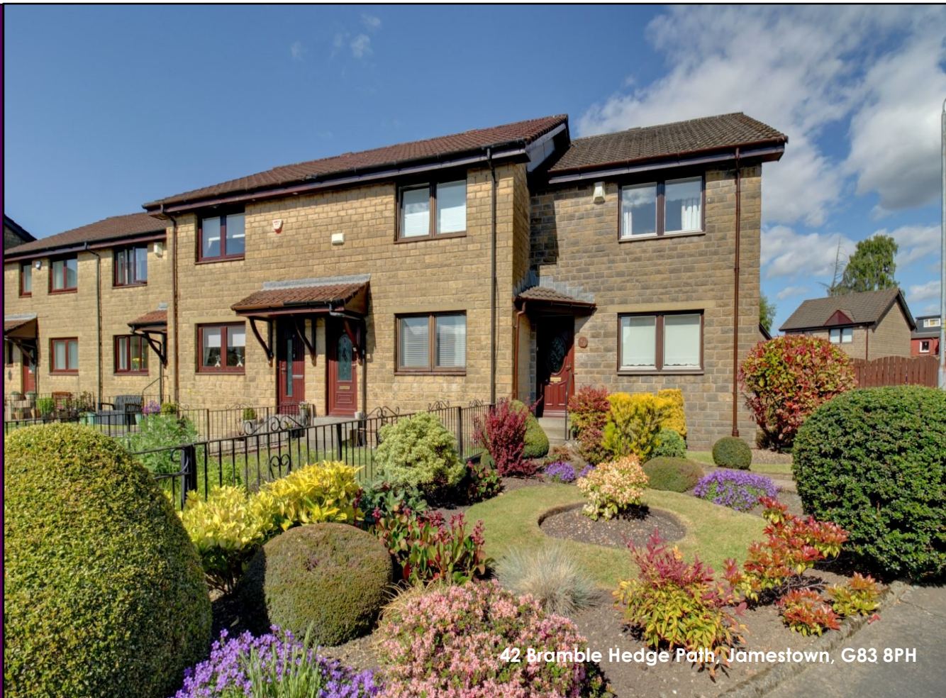
42 Bramble Hedge Path, Jamestown, G83 8PH

This well presented and rarely available two-bedroom end terrace villa sits within the much-admired Heatherdale Village estate and will be of interest to a wide range of buyers including first time, young families and downsizers.