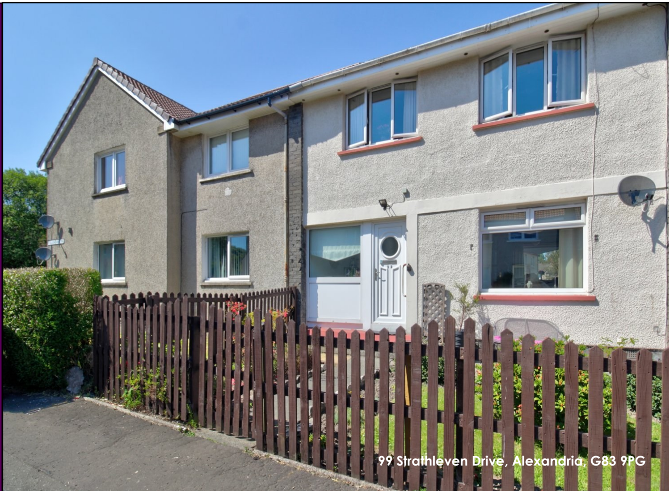
99 Strathleven Drive, Alexandria, G83 9PG

David Muir Estate Agents offer to the market this spacious three-bedroom mid-terrace villa which sits in the popular Tullichewan Estate and is in close proximity to local schooling, convenience store and public transport links.