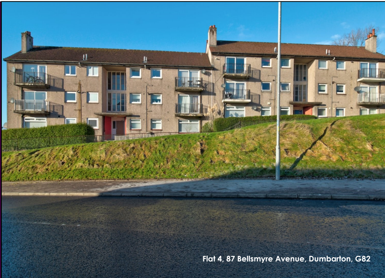
Flat 4, 87 Bellsmyre Avenue, Dumbarton, G82

David Muir Estate Agents are delighted to present to the market this well presented two-bedroom ground floor flat in the popular Bellsmyre area of Dumbarton.