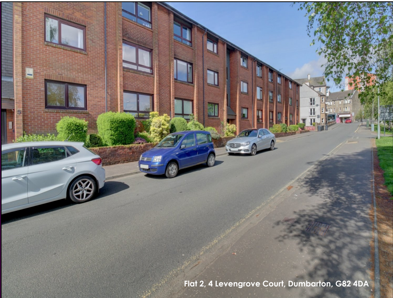
Flat 2, 4 Levensgrove Court, Dumbarton, G82 4DA

This impressive modern two-bedroom first floor apartment enjoys lovely views over the River Leven and is within walking distance to the town centre shops, bars and restaurants as well as train and bus links.