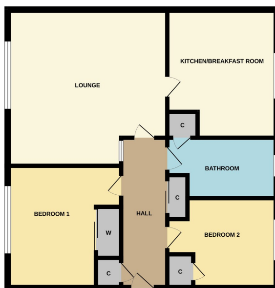
TWO BEDROOM FLAT

Whilst every attempt has been made to ensure the accuracy of the floorplan contained here, measurements of doors, windows, rooms and any other items are approximate and no responsibility is taken for any error, omission or mis-statement. This plan is for illustrative purposes only and should be used as such by any prospective purchaser. The fixtures, systems and appliances shown have not been tested and no guarantee as to their operability or efficiency can be given. Made with floorplan 10000