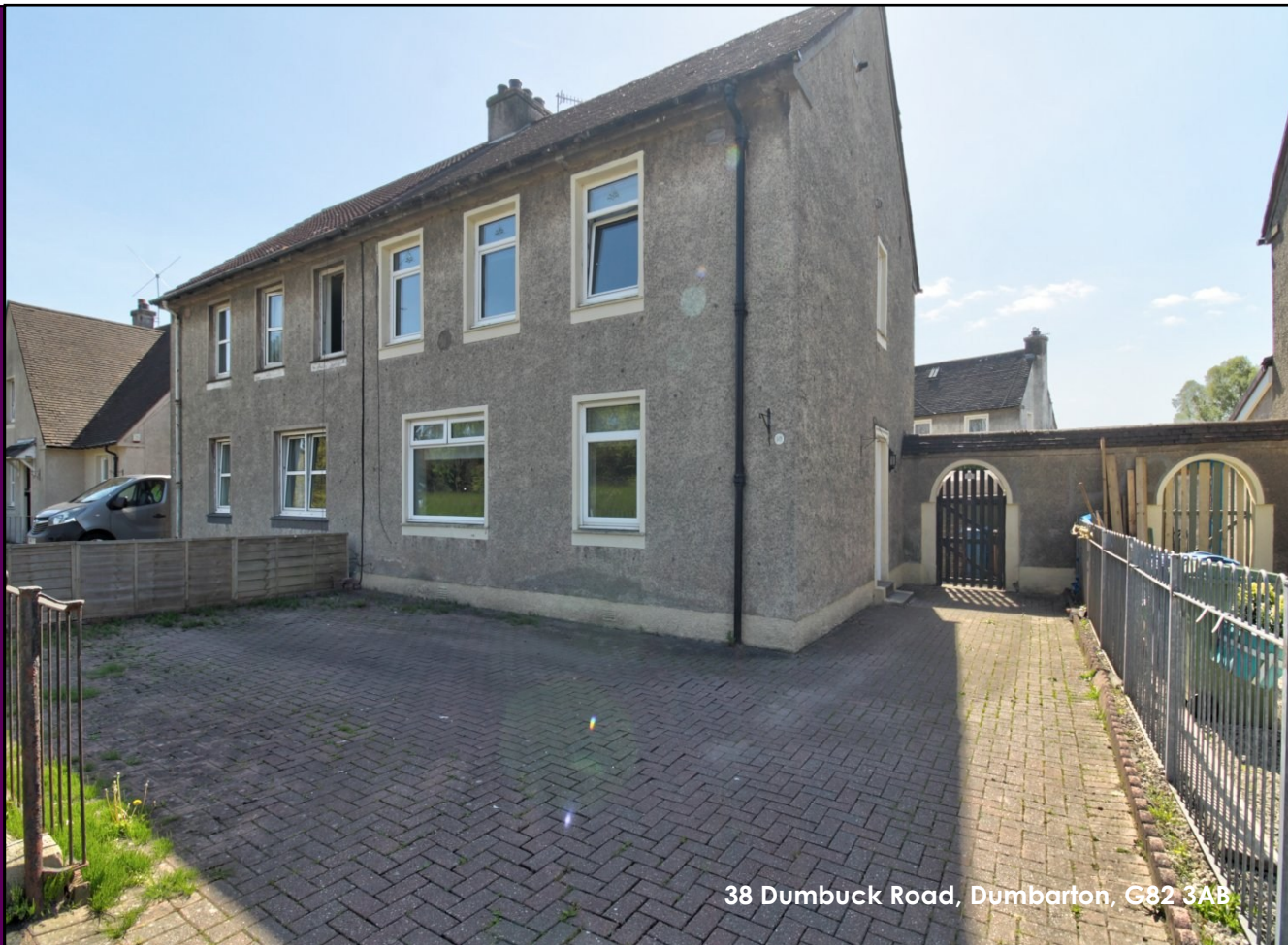
38 Dumbuck Road, Dumbarton, G82 3AB

David Muir Estate Agents present to the market this four-bedroom semi-detached villa which enjoys a central location, close to schooling, shops and public transport links.