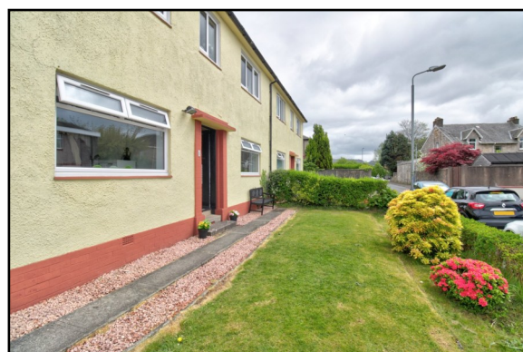
TWO BEDROOM LOWER COTTAGE FLAT

David Muir Estate Agents offer to the market this spacious three-bedroom lower cottage flat which is conveniently located close to nurseries, schooling, shops and public transport links.