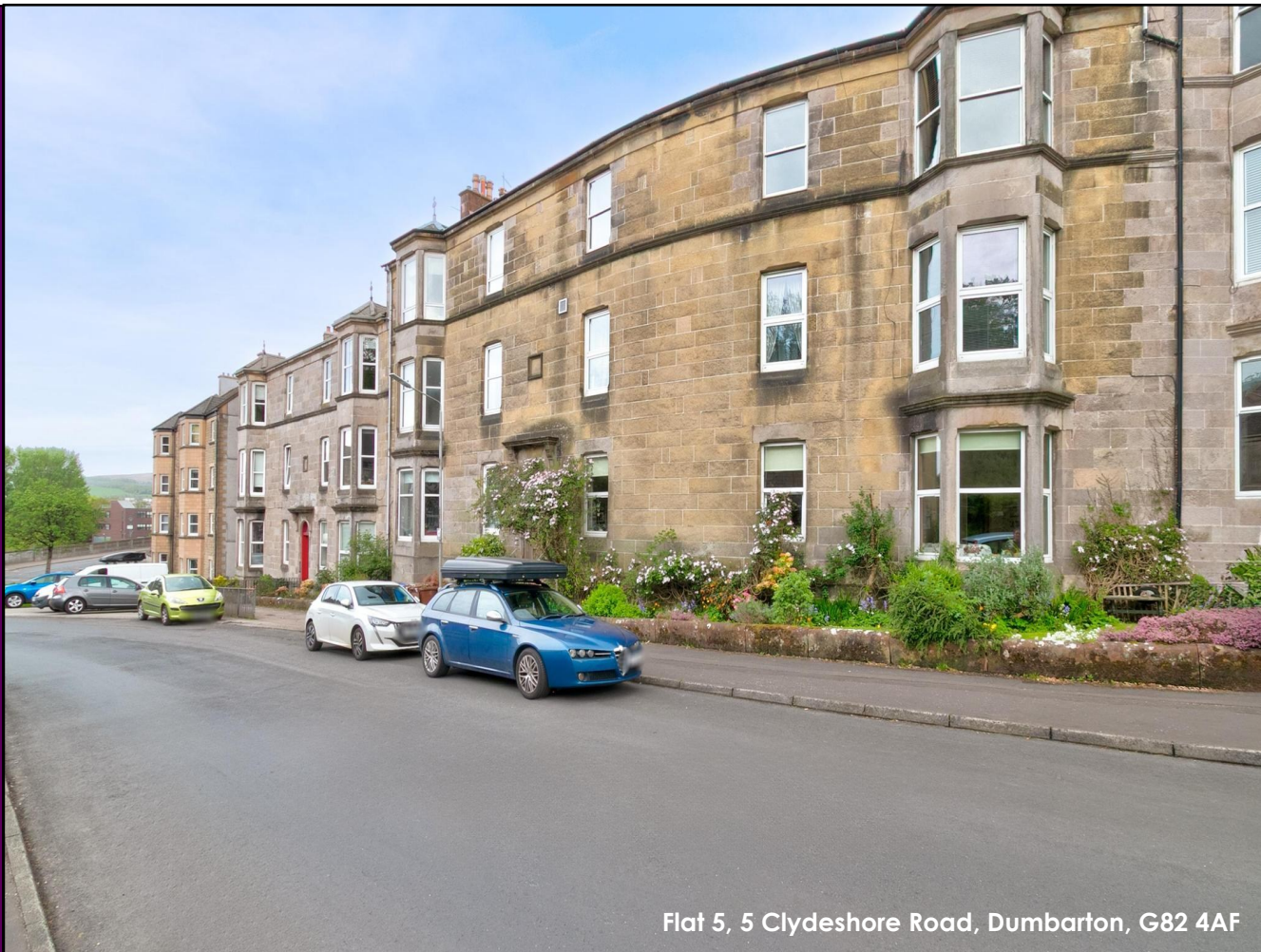
Flat 5, 5 Clydeshire Road, Dumbarton, G82 4AF

Forming part of the prestigious Clydeshire Road address, this stunning three-bedroom apartment sits on the top floor and is without doubt a delightful proposition for the most discerning of buyers.