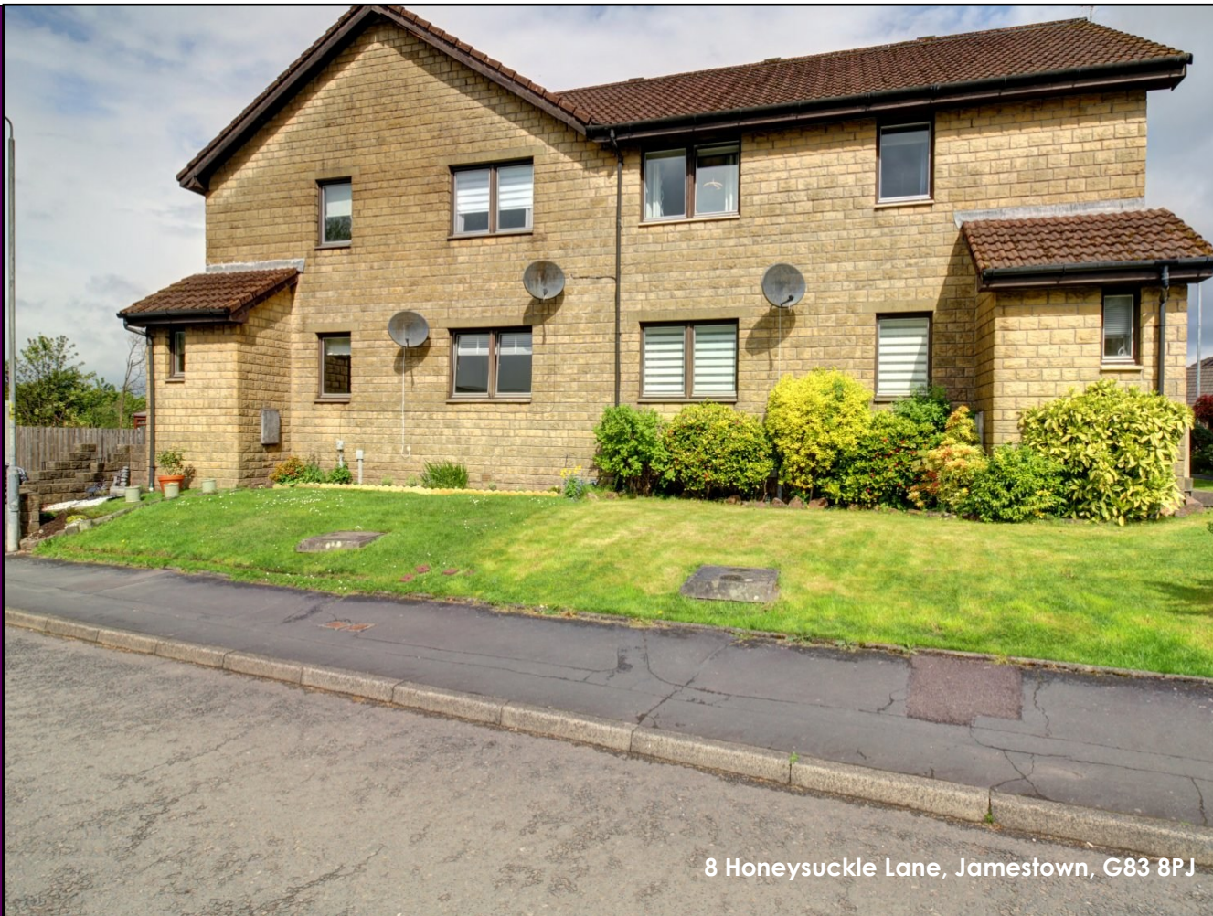
8 Honeysuckle Lane, Jamestown, G83 8PJ

We are delighted to offer to the market this spacious two-bedroom upper cottage style flat which sits within the much-admired Heatherdale Village estate, conveniently located close to shops, amenities and public transport links.