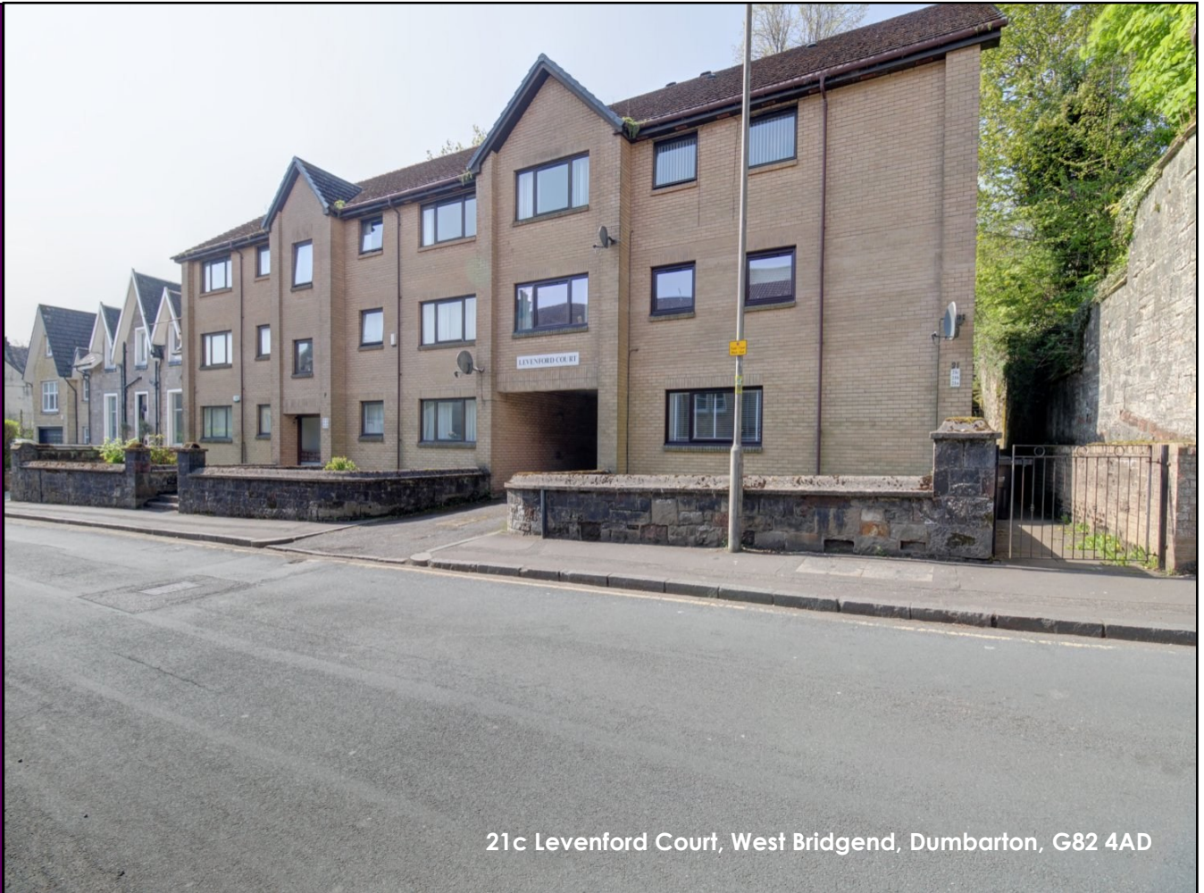
21c Levenford Court, West Bridgend, Dumbarton, G82 4AD

David Muir Estate Agents offer to the market this spacious three-bedroom second floor apartment which is conveniently located close to Levensgrove Park, Dumbarton town centre and excellent public transport links.