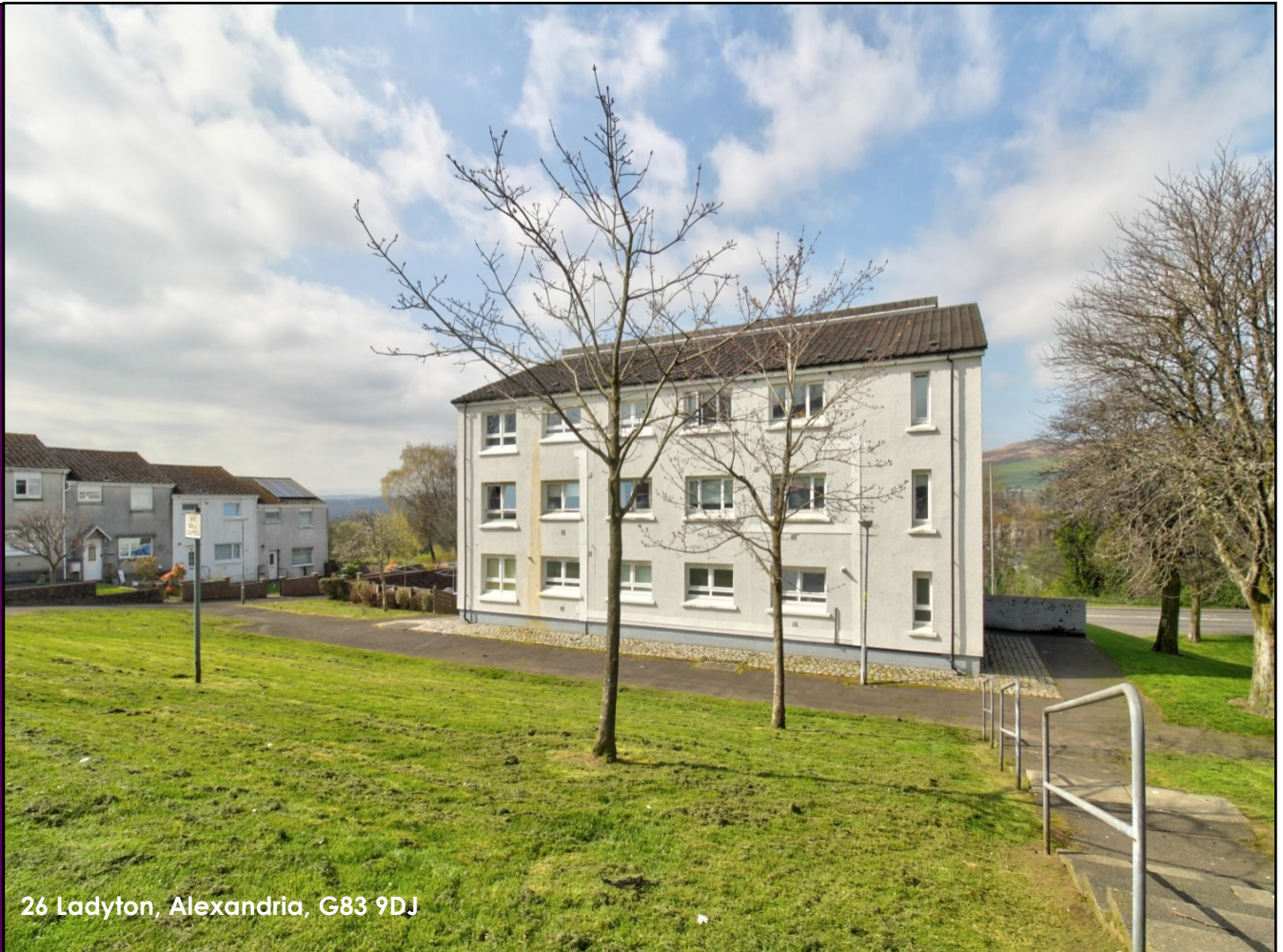
26 Ladyton, Alexandria, G83 9DJ

This spacious two-bedroom top floor flat is located in the popular Ladyton Estate and is close to a wide range of shops, schooling and public transport links. The property will be ideal for first time buyers or for the buy to let market due to current demand and a potential rental yield of over 10%