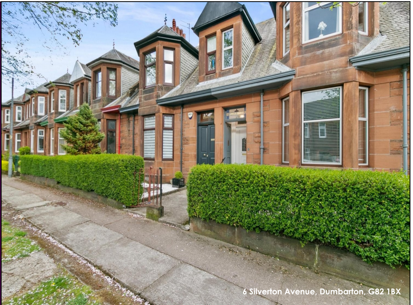
6 Silverton Avenue, Dumbarton, G82 1BX

Located in the favourable Dumbarton East, this 3 bedroom mid terrace villa has a high specification throughout. The property benefits from quality flooring and carpeting, with fresh light décor complimenting the many traditional features of the property. This family home must be seen to fully appreciate the accommodation on offer.