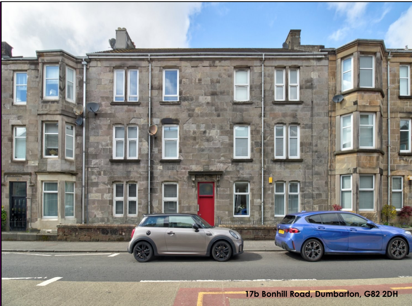
17b Bonhill Road, Dumbarton, G82 2DH

David Muir Estate Agents are delighted to present to the market this fantastic two-bedroom ground floor flat which forms part of a traditional grey sandstone block in the ever-popular Bonhill Road, which is within walking distance to the town centre and public transport links.