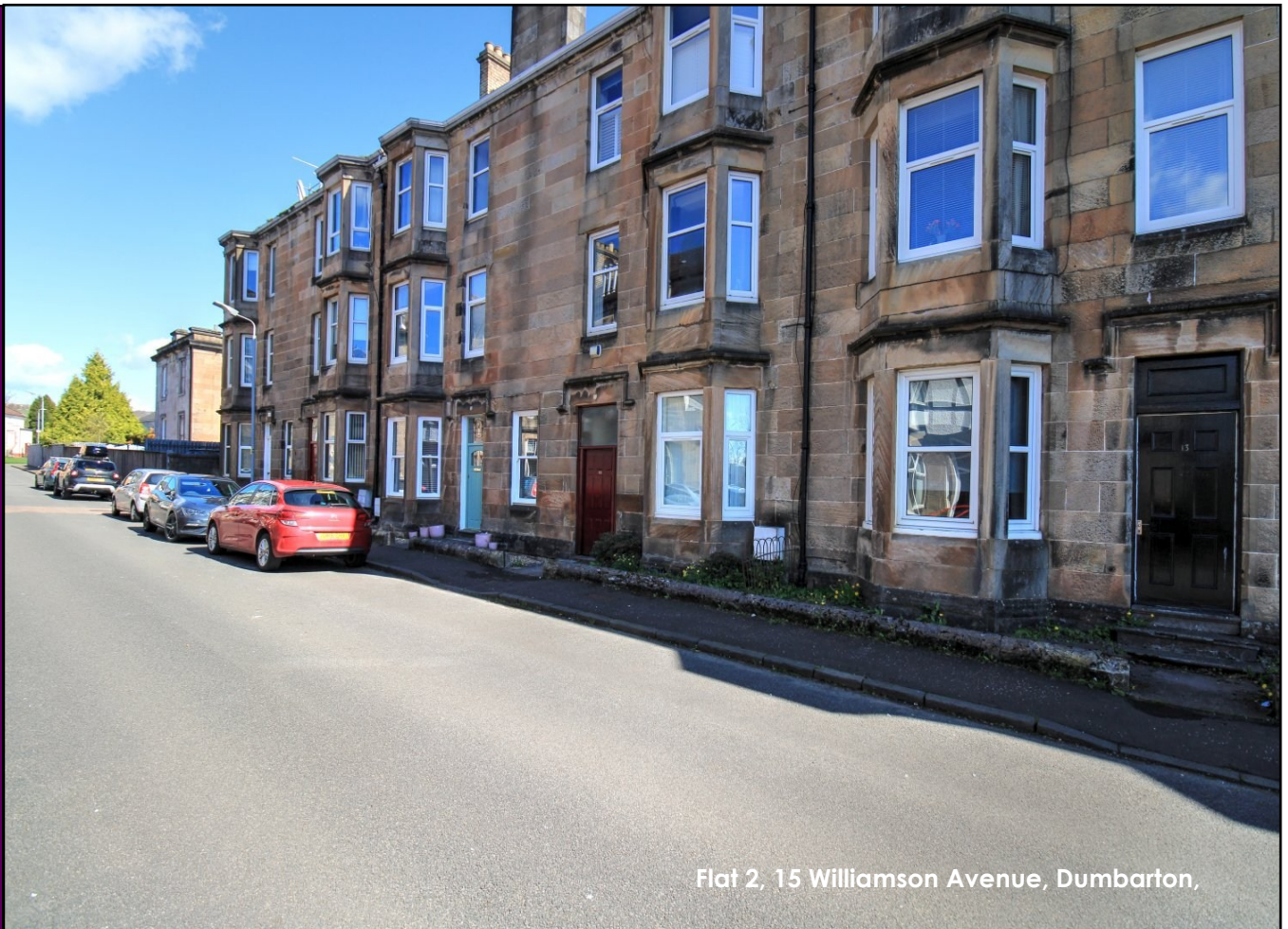
Flat 2, 15 Williamson Avenue, Dumbarton,

This fantastic two-bedroom first floor flat forms part of a traditional sandstone block in the popular Williamson Avenue, which is ideally located close to a wide range of amenities, schools and public transport links. This generously proportioned property will be of interest to a wide range of buyers and early viewing is advised to fully appreciate it.