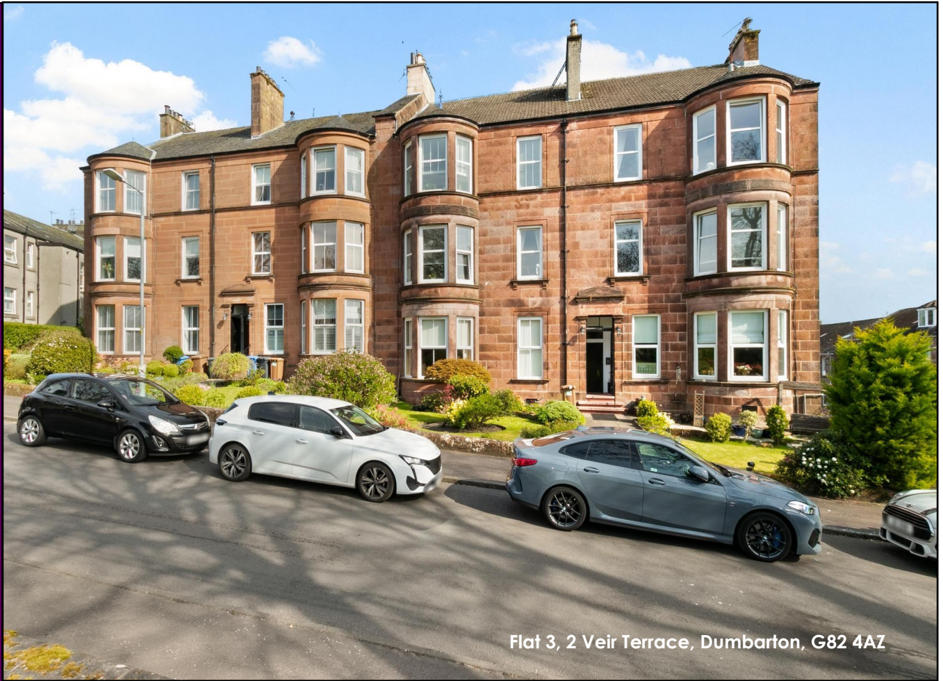
Flat 3, 2 Veir Terrace, Dumbarton, G82 4AZ

This exquisite first-floor apartment is finished to an exceptional standard, showcasing generous proportions throughout. Situated in the highly coveted Kirktonhill area, the property enjoys proximity to an array of local amenities and overlooks the beautiful Levensgrove Park.