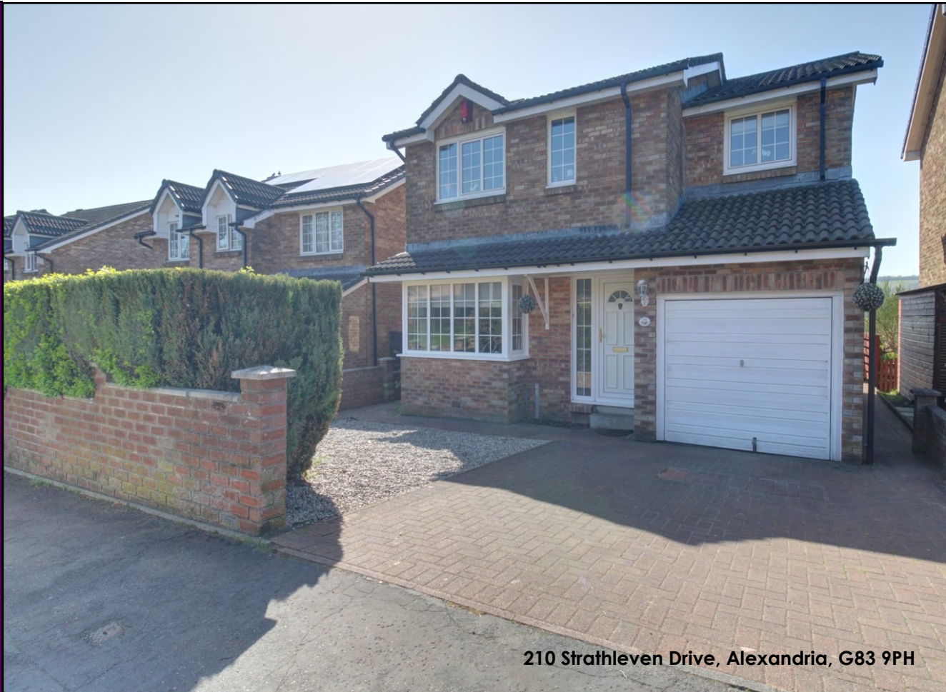
210 Strathleven Drive, Alexandria, G83 9PH

David Muir Estate Agents are delighted to present to the market this well presented four-bedroom detached villa, with integrated garage, which is located in this popular residential estate between Alexandria and Dumbarton town centres.