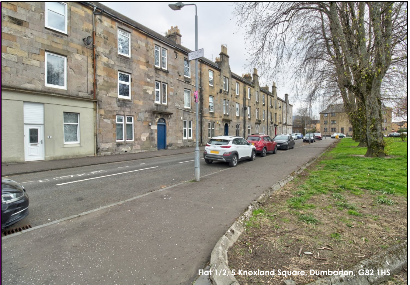
Flat 1/2, 5 Knoxland Square, Dumbarton, G82 1HS

David Muir Estate Agents offer to the market this two-bedroom first floor flat which forms part of a traditional tenement block which sits in the heart of the Dumbarton East community, within minutes of primary and secondary schooling, local shops, retail park and transport links.