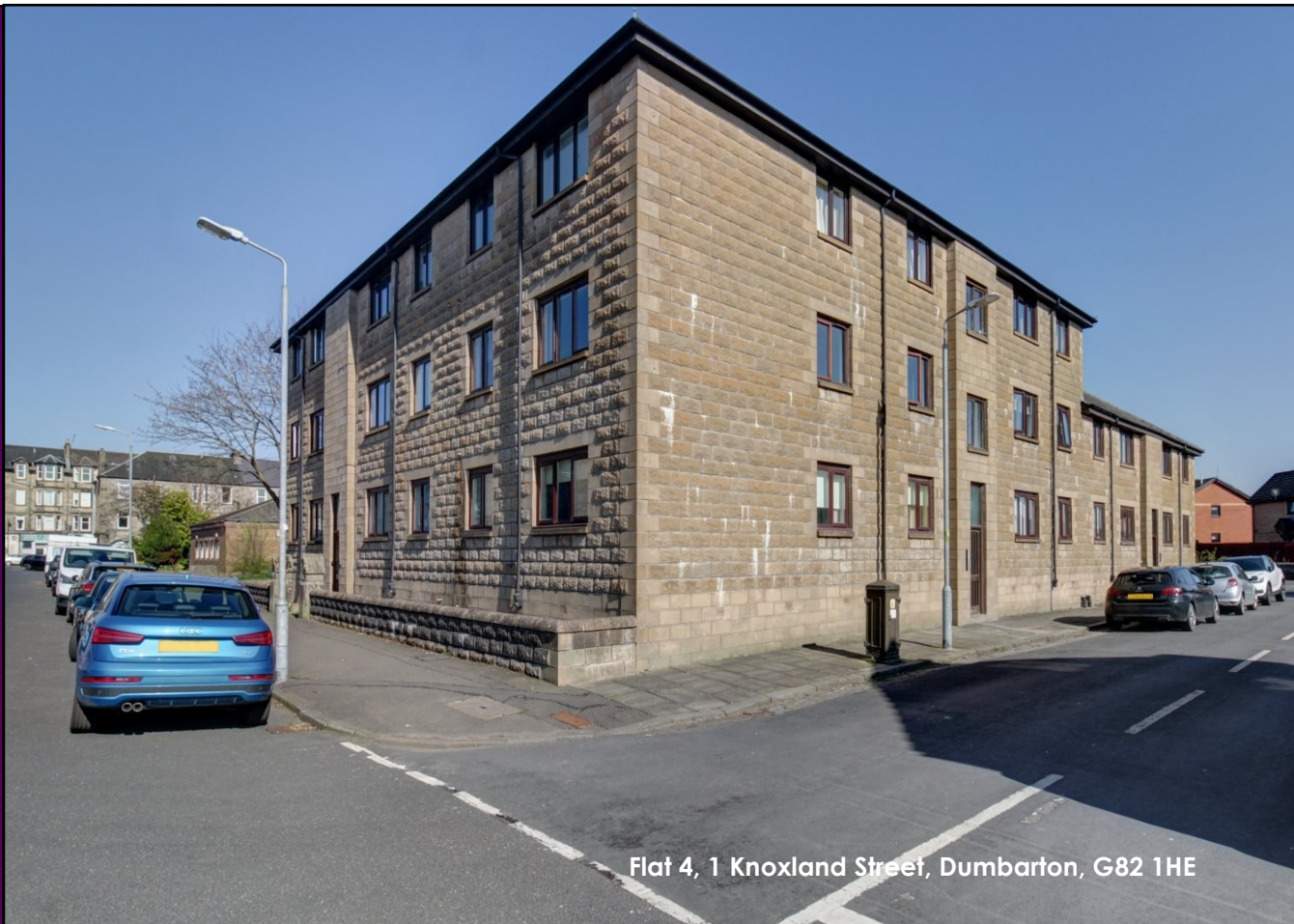
Flat 4, 1 Knoxland Street, Dumbarton, G82 1HE

David Muir Estate Agents present to the market this well-presented two-bedroom first floor flat which sits in the heart of the Dumbarton East community, within minutes of primary and secondary schooling, local shops, retail park and transport links.