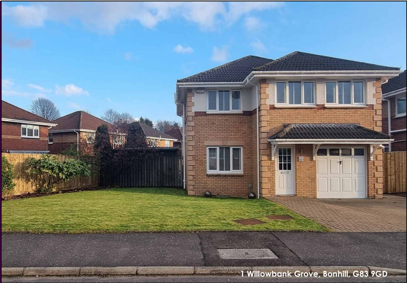
1 Willowbank Grove, Bonhill, G83 9GD

The agent is delighted to offer to the market this beautifully designed four-bedroom detached home located within this much sought after Turnberry Homes development. This spacious property is perfect for modern family living, boasting large gardens and an integral garage.