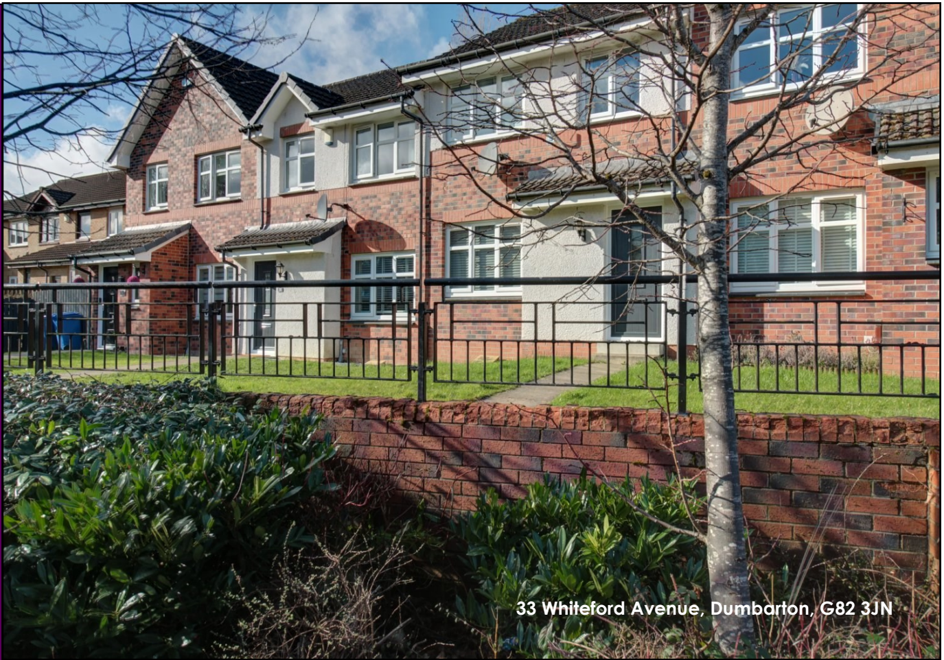
33 Whiteford Avenue, Dumbarton, G82 3JN

David Muir Estates offer to the market this immaculately presented modern three-bedroom mid-terraced villa in the ever-popular Whiteford Avenue area of Dumbarton.