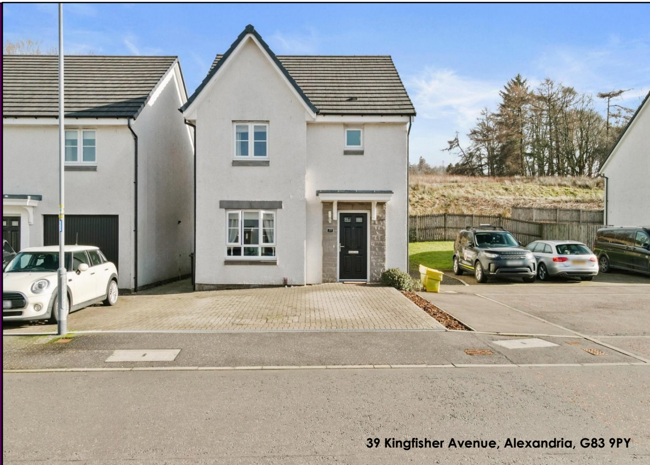
39 Kingfisher Avenue, Alexandria, G83 9PY

David Muir Estate Agents are delighted to offer to the market this beautifully presented three-bedroom detached villa which is located in the modern Millfield Estate built by renowned builders Barratt Homes.