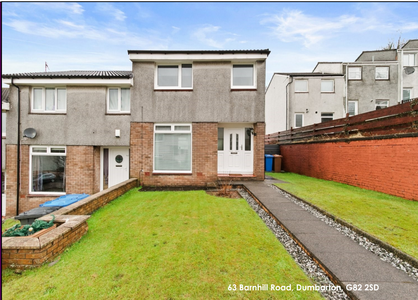
63 Barnhill Road, Dumbarton, G82 2SD

David Muir Estate Agents are delighted to present to the market this beautifully presented three-bedroom end-terrace villa which sits in an elevated position in this popular residential estate to the north of the town, with lovely views over towards Dumbarton rock and beyond.