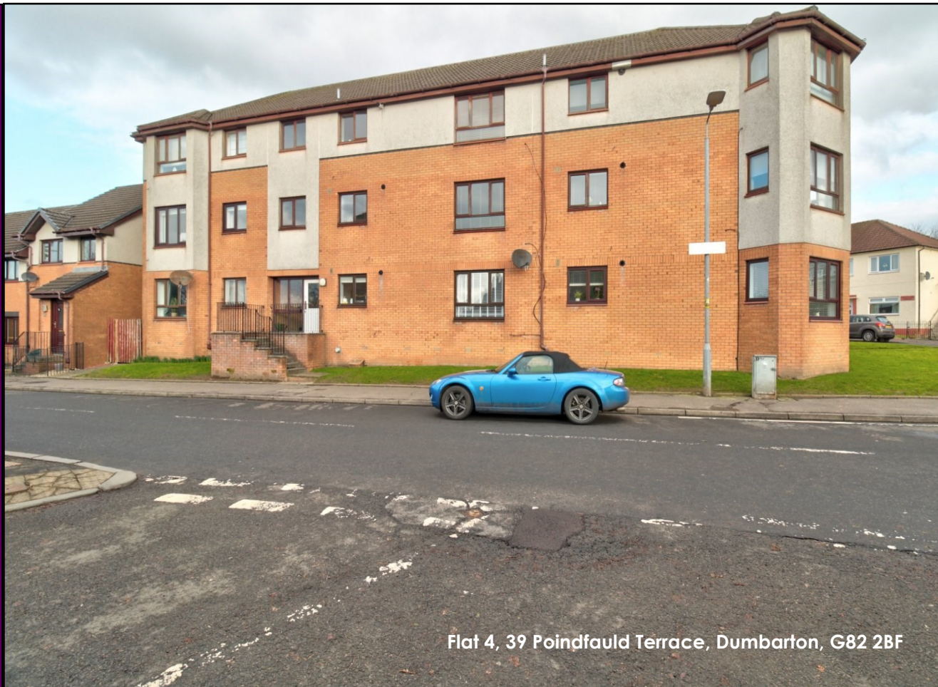
Flat 4, 39 Poindfauld Terrace, Dumbarton, G82 2BF

David Muir Estate Agents offer to the market this well-presented two-bedroom first floor flat which forms part of a modern block just a short walk from the town centre, local schooling and Dumbarton Central train station.