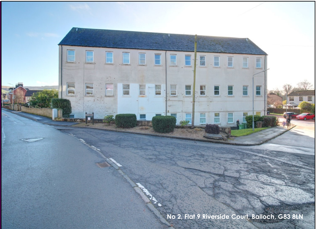
No 2, Flat 9 Riverside Court, Balloch, G83 8LN

David Muir Estate Agents offer to the market this two-bedroom second floor flat which is conveniently located within walking distance to shops, schools and Balloch train station.