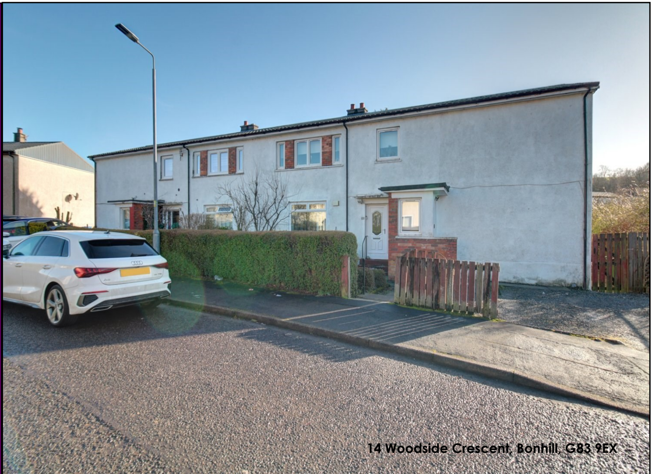
14 Woodside Crescent, Bonhill, G83 9EX

David Muir Estate Agents offer to the market this extremely spacious three bedroom upper flat which is located in the Old Bonhill area of Alexandria. The property is presented in walk-in condition and early viewing is highly recommended.