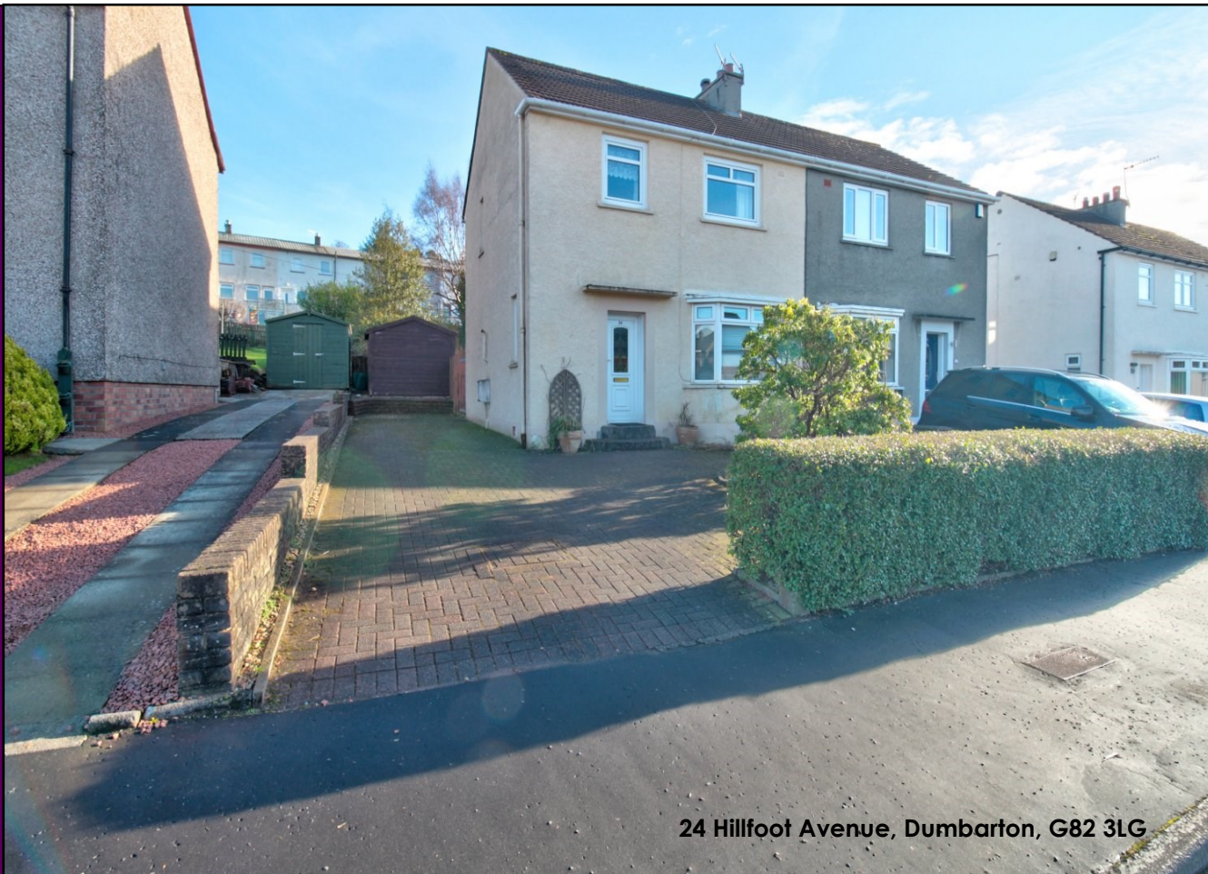
24 Hillfoot Avenue, Dumbarton, G82 3LG

David Muir Estate Agents offer to the market this three-bedroom semi-detached villa which sits in a good-sized plot in the popular address of Hillfoot Avenue.