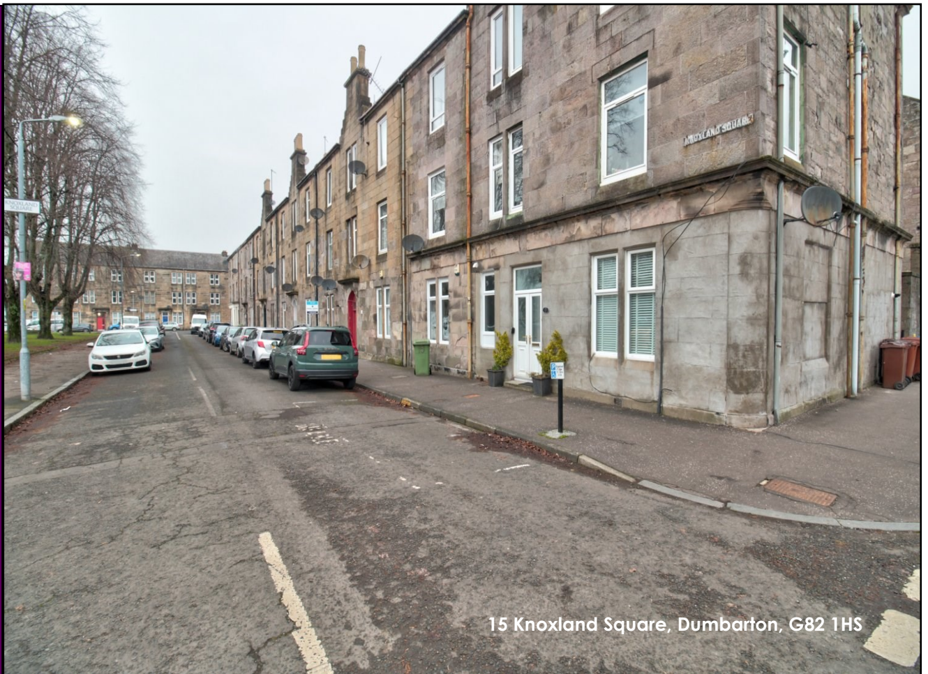
15 Knoxland Square, Dumbarton, G82 1HS

David Muir Estate Agents are delighted to offer to the market this well presented, one bedroom ground floor flat which benefits from main door access off of Knoxland Square, and a side door, off the kitchen, which gives you access to the rear garden and private cellar.