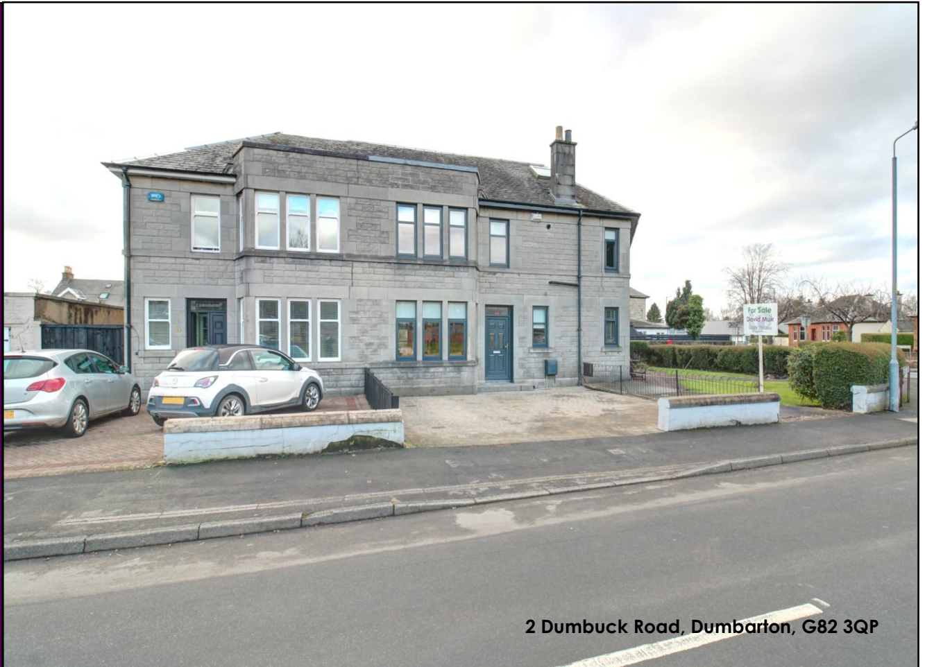
2 Dumbuck Road, Dumbarton, G82 3QP

David Muir Estate Agents are delighted to bring to the market this stunning three-bedroom mid-terraced villa which forms part of a traditional grey sandstone block in this most sought after of addresses.