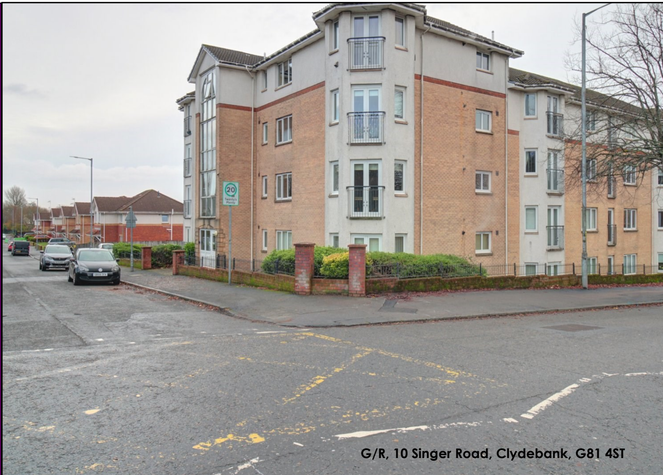
G/R, 10 Singer Road, Clydebank, G81 4ST

GROUND FLOOR 889 sq.ft. (82.6 sq.m.) approx.