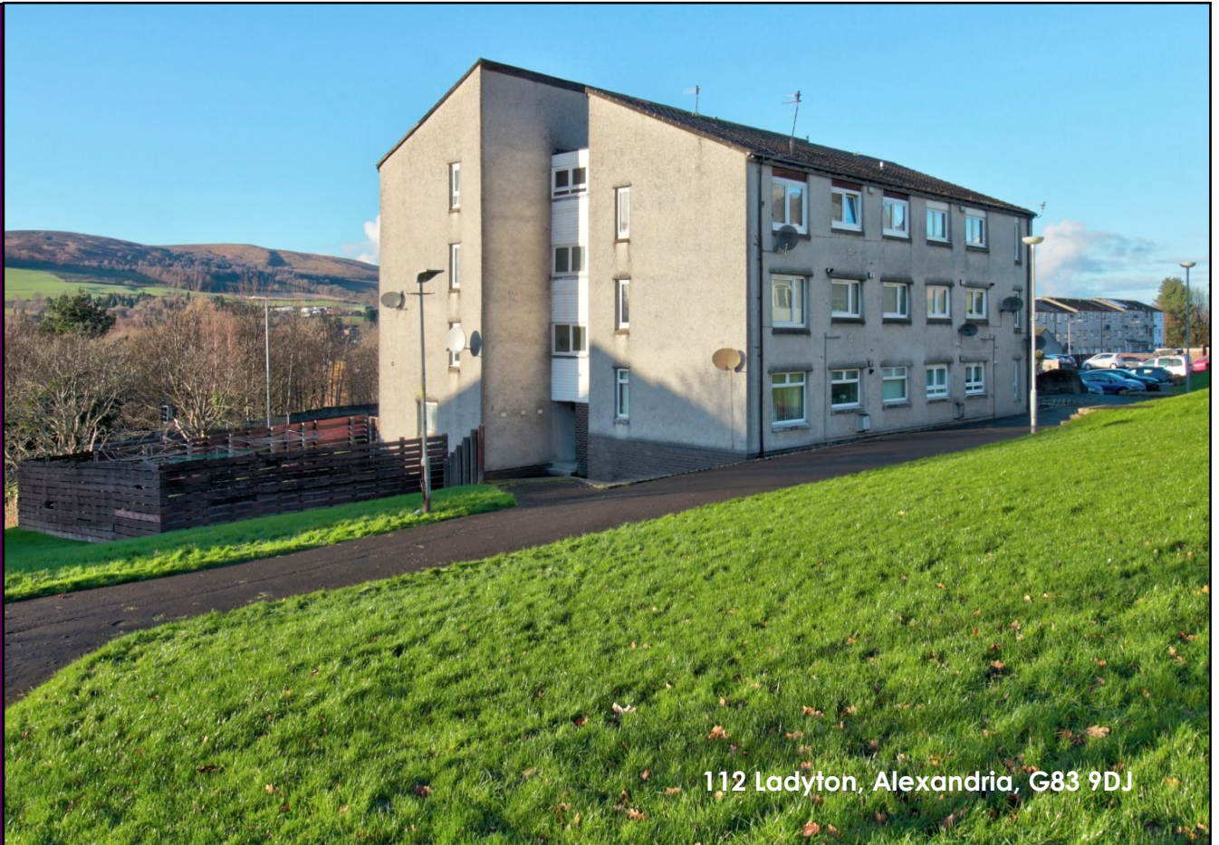
112 Ladyton, Alexandria, G83 9DJ

This spacious two-bedroom third floor flat is located in the popular Ladyton Estate and is close to a wide range of shops, schooling and public transport links. The property will require modernising throughout but will make an ideal home on completion of these works.