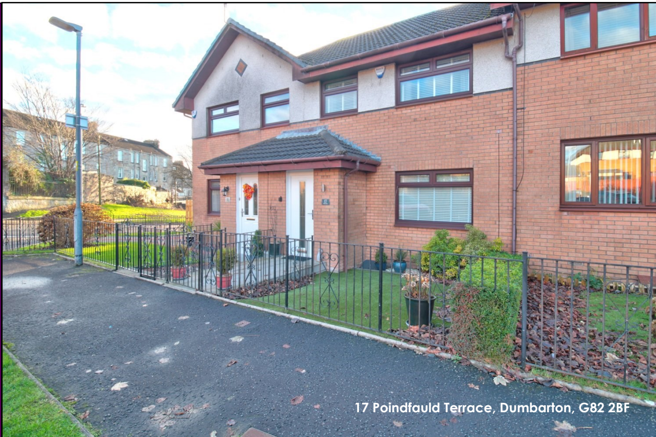
17 Poindfauld Terrace, Dumbarton, G82 2BF

David Muir Estates is delighted to offer this superb 3 bedroom mid terrace villa to the market. The caring owners have left no stone unturned in presenting their home in pristine condition throughout.