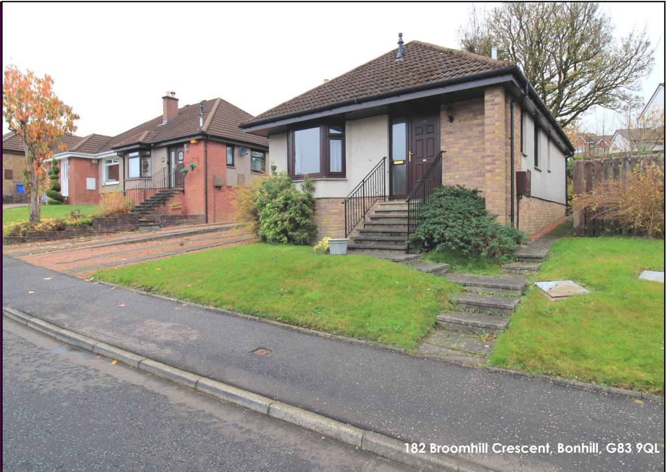
182 Broomhill Crescent, Bonhill, G83 9QL

David Muir Estate Agents bring to the market this spacious two-bedroom detached bungalow which is located in this established residential estate in Bonhill.