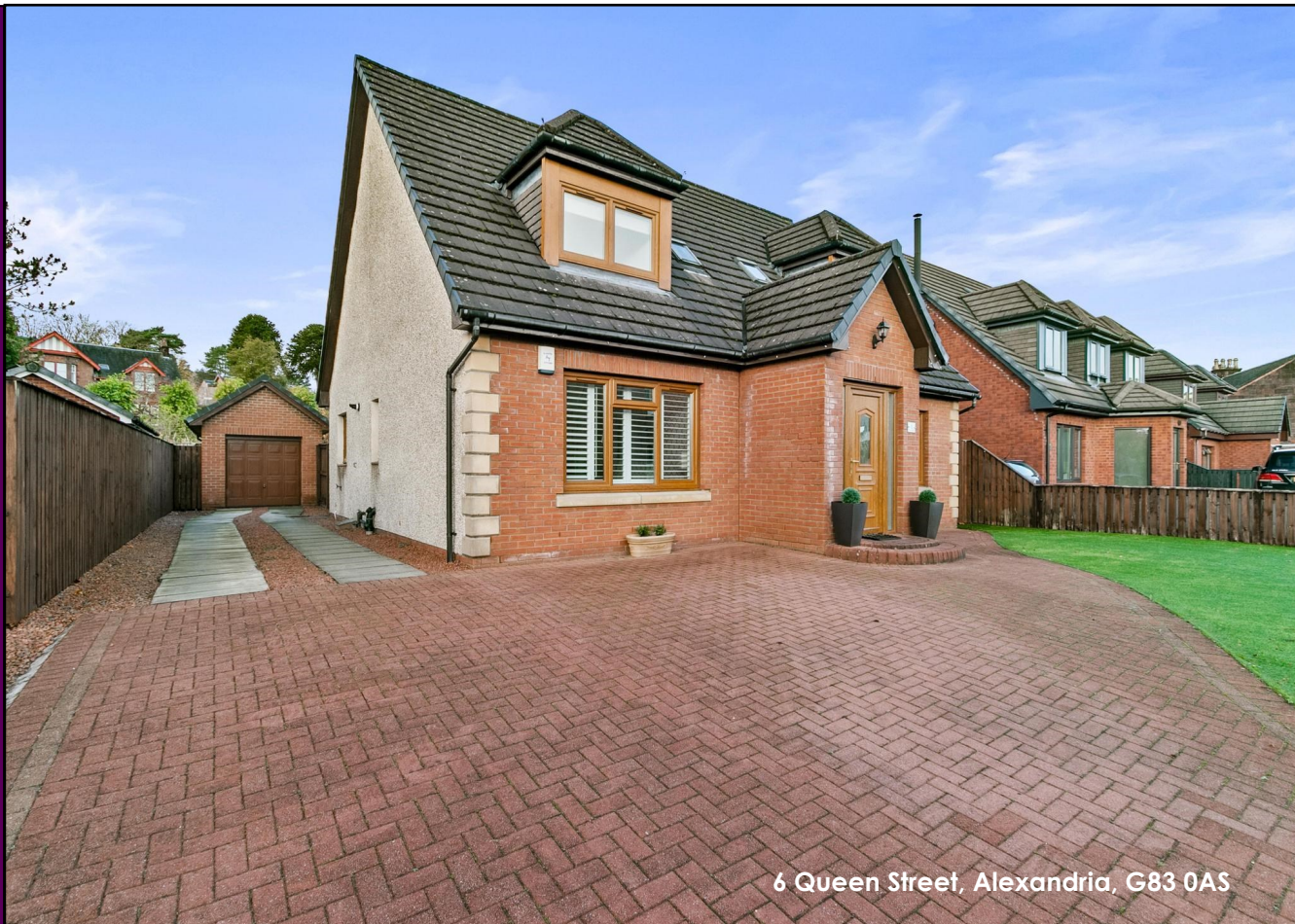
6 Queen Street, Alexandria, G83 0AS

This stunning four-bedroom detached chalet style villa which is located in the prestigious address of Queen Street is presented to the market in absolute walk in condition.