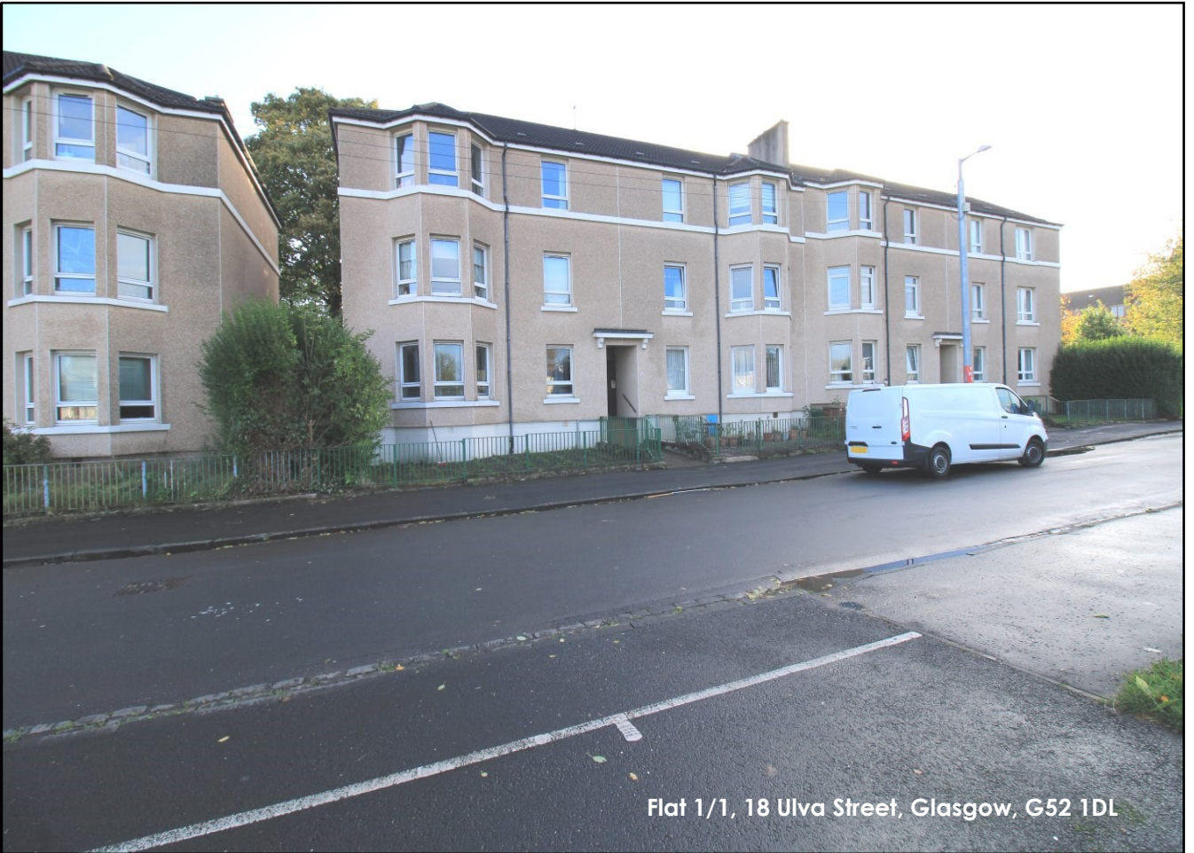
Flat 1/1, 18 Ulva Street, Glasgow, G52 1DL

This two bedroom first-floor flat is located in this popular Craigton address in the Southside of Glasgow, with a wide range of shops, Bellahouston park and leisure centre and regular public transport links within walking distance.