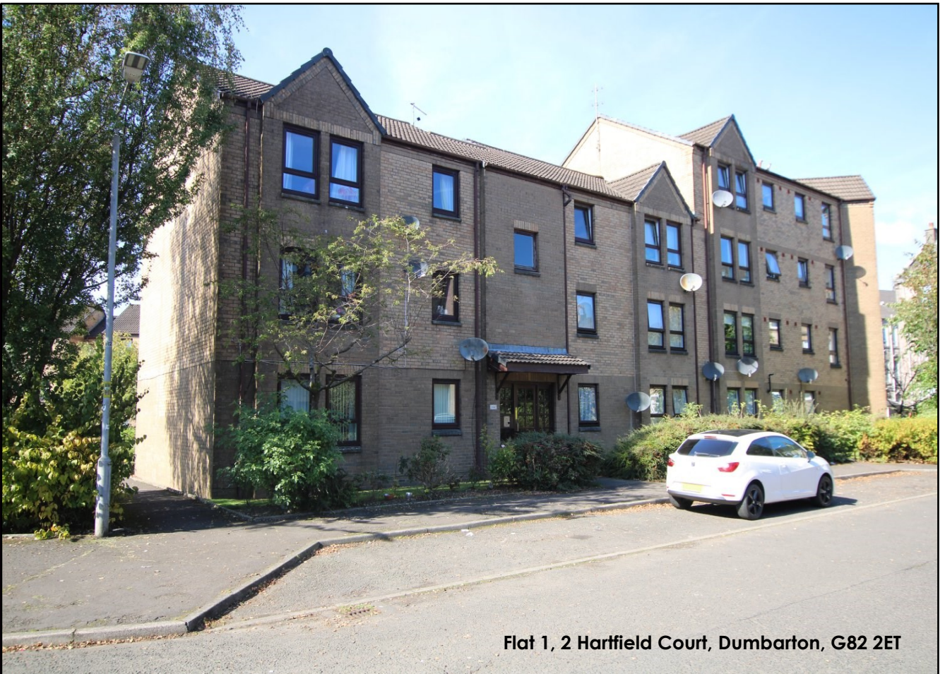
Flat 1, 2 Hartfield Court, Dumbarton, G82 2ET

Located in an extremely central location close to Dumbarton Common, leisure centre, retail outlets and central railway station sits this 2 bedroom ground floor flat. Off street parking for residents and visitors.