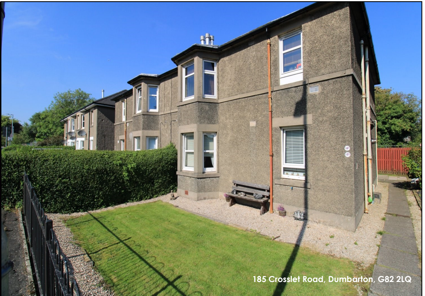
185 Crosslet Road, Dumbarton, G82 2LQ

This extremely well presented two-bedroom lower cottage flat is conveniently situated within the popular Silverton area and is within walking distance of all of Dumbarton East's many amenities. Benefitting from double glazing and gas-fired central heating this spacious home represents excellent value in today's market.