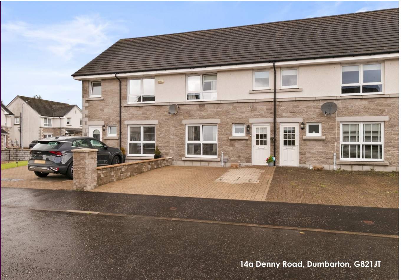
14a Denny Road, Dumbarton, G821JT

Located within the ever popular and convenient Castle Quay estate this modern 3 bedroom mid terrace villa offers well proportioned accommodation over the traditional two levels. Built by the renowned Turnberry Homes in 2013, with families in mind, this select home offers a high interior specification and features throughout.