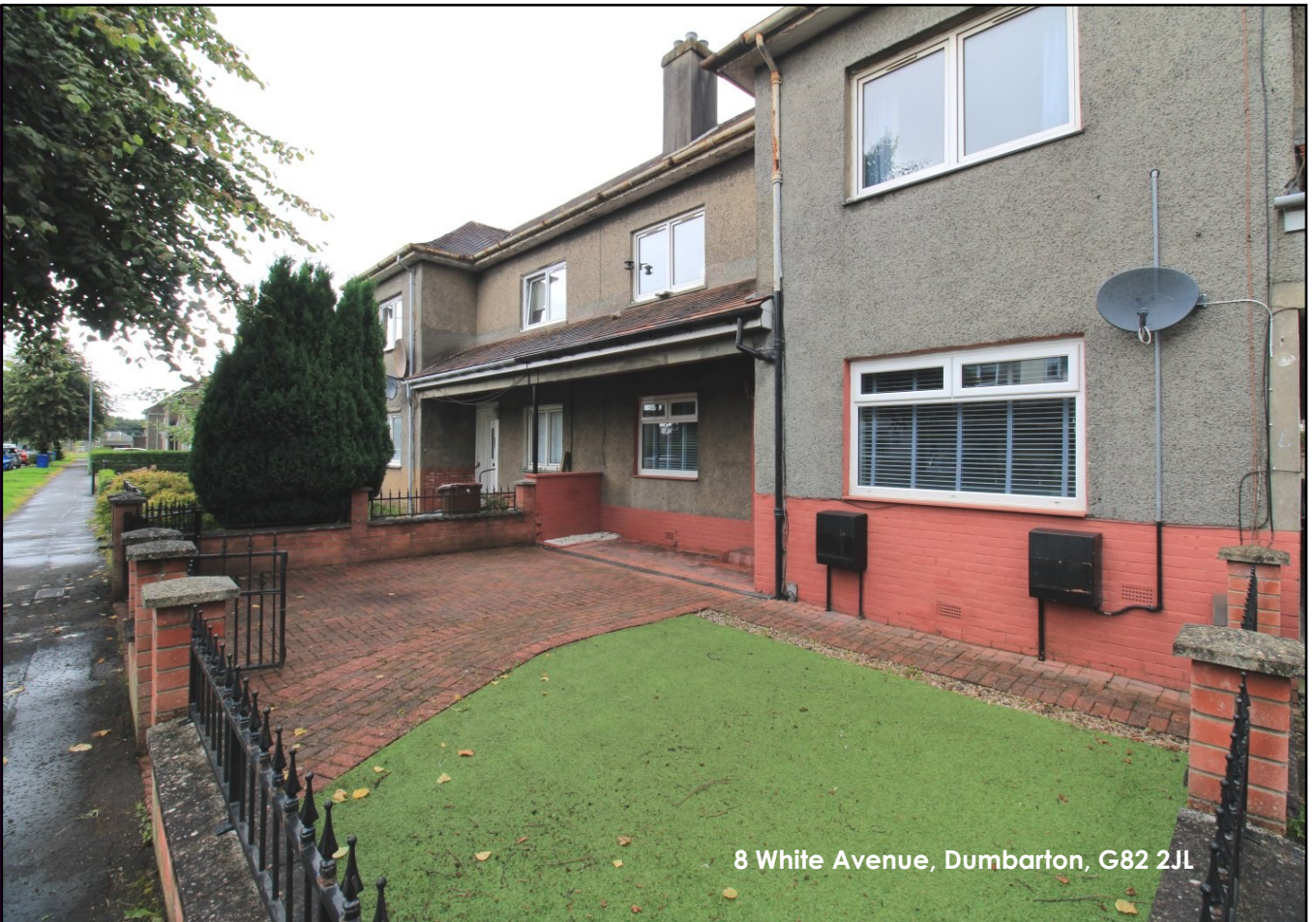
8 White Avenue, Dumbarton, G82 2JL

David Muir Estate Agents are delighted to present to the market this well presented and generously proportioned two-bedroom lower cottage flat located in the popular Silverton area in Dumbarton's east end.