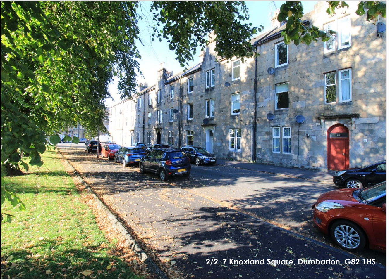
2/2, 7 Knoxland Square, Dumbarton, G82 1HS