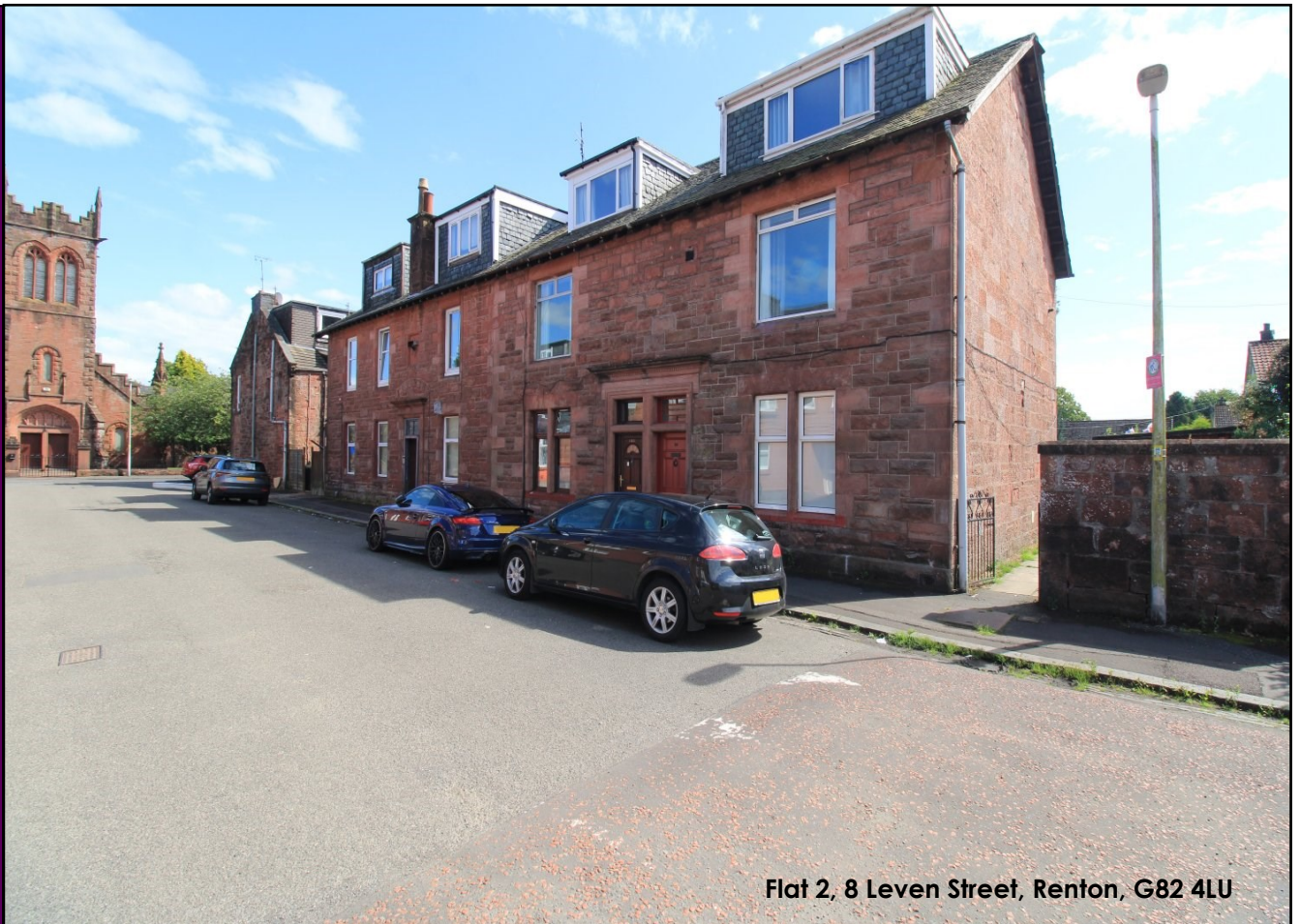
Flat 2, 8 Leven Street, Renton, G82 4LU

David Muir Estate Agents are delighted to present to the market this spacious two-bedroom maisonette, which forms part of a traditional red sandstone block, in a popular residential location in Renton.