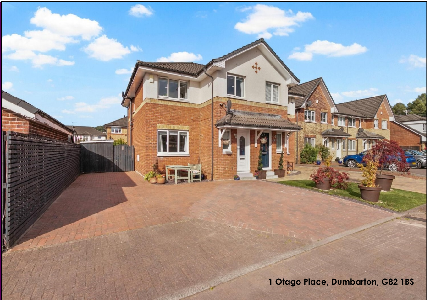
1 Otago Place, Dumbaron, G82 1BS

This impressive family size semi detached villa enjoys cul de sac setting and sits within the heart of the highly exclusive and much admired Mary Fisher development. Created by the well-respected builder, Turnberry Homes, this prestigious home offers an extremely spacious layout over the traditional two levels