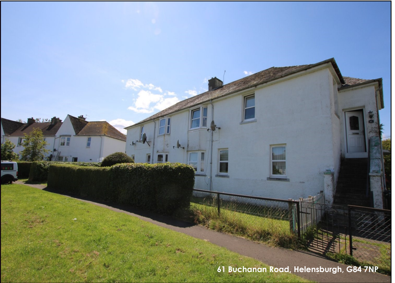
61 Buchanan Road, Helensburgh, G84 7NP

Offering to the market this spacious 3 bedroom upper cottage flat. The accommodation on offer comprises of reception hallway, bay window living room, good size kitchen and bathroom. 3 double bedrooms and excellent interior storage.