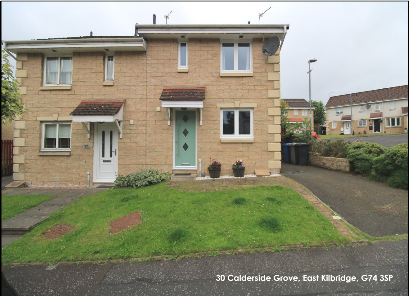
30 Calderside Grove, East Kilbridge, G74 3SP

David Muir Estate Agents are delighted to present to the market this immaculately presented three-bedroom semi-detached villa which is set within the very popular and sought after Calderside Grove Estate, Calderwood, East Kilbride.