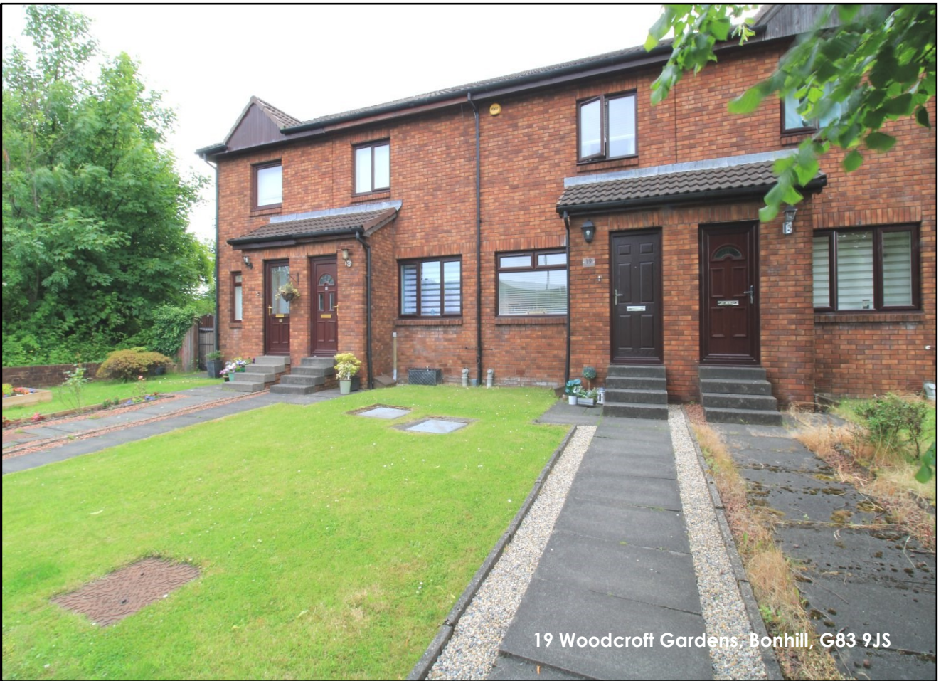
19 Woodcroft Gardens, Bonhill, G83 9JS

David Muir Estate Agents are delighted to present to the market this immaculately presented and rarely available two-bedroom mid terrace villa which sits in a quiet spot in Bonhill and will be of interest to a wide range of buyers including first time, young families and downsizers.