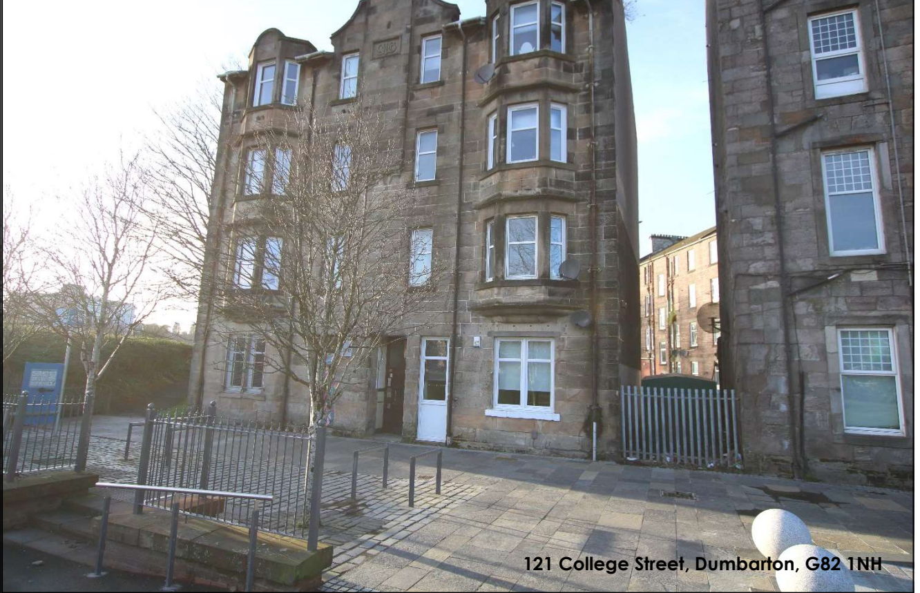
121 College Street, Dumbarton, G82 1NH

Extremely well presented 2 bedroom ground floor flat. Recently redecorated in light shades complimenting the quality wood effect laminate flooring and timber panelled interior doors throughout. The flat has the added benefit of gas fired central heating and double glazed sealed units on all windows.