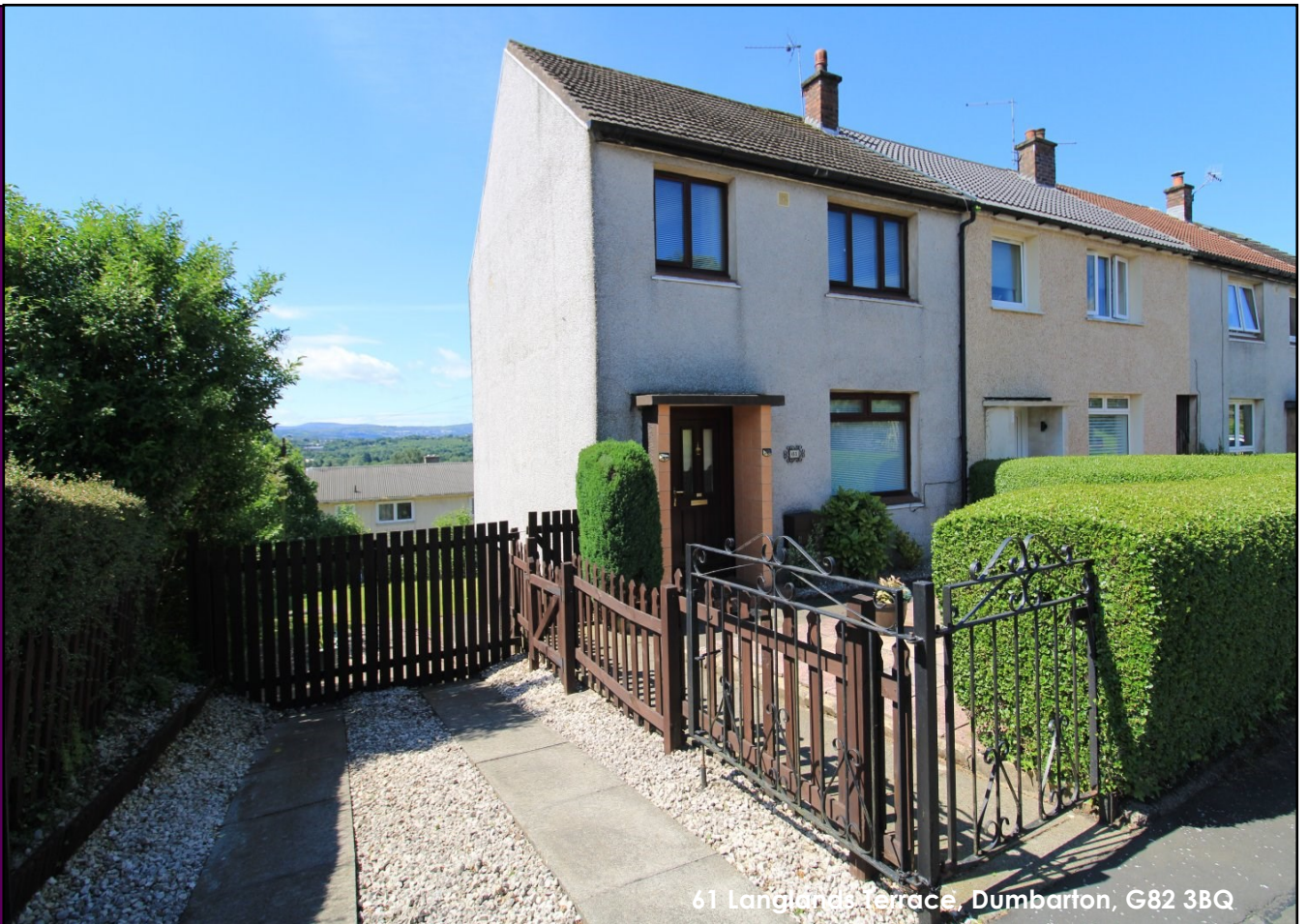
61 Langlands Terrace, Dumbarton, G82 3BQ

David Muir Estate Agents are delighted to present to the market this immaculately presented three-bedroom end terrace villa which sits on a generous plot and offering spacious accommodation throughout.