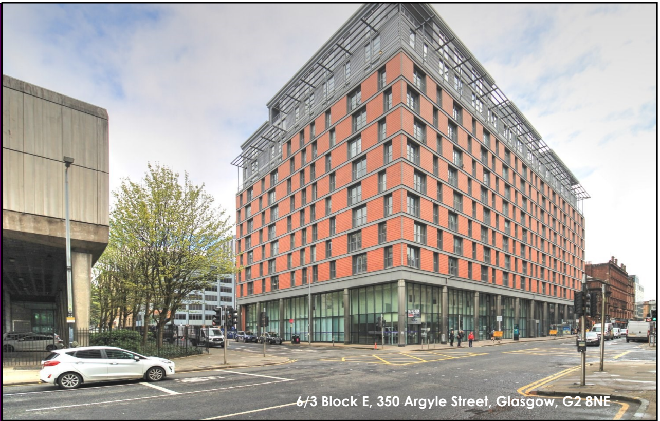
6/3 Block E, 350 Argyle Street, Glasgow, G2 8NE

We are delighted to offer to the market this spacious two-bedroom, sixth floor, modern apartment which is located within the incredibly well placed and popular Bridge Apartments development in the heart of Glasgow's City Centre. The development has an impressive main entrance lobby with secure entry, concierge service and a central courtyard.