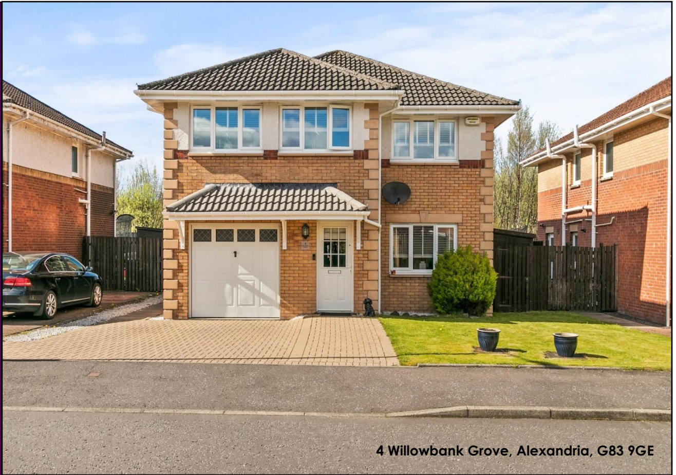
4 Willowbank Grove, Alexandria, G83 9GE

The agent is delighted to offer to the marketplace, this stunningly presented, bright & spacious four-bedroom modern detached family home within this much sought after Turnberry Homes development. The property has been tastefully finished throughout with quality fixtures and finishing's along with both modern and neutral tones which will appeal to as well as delight all who view.