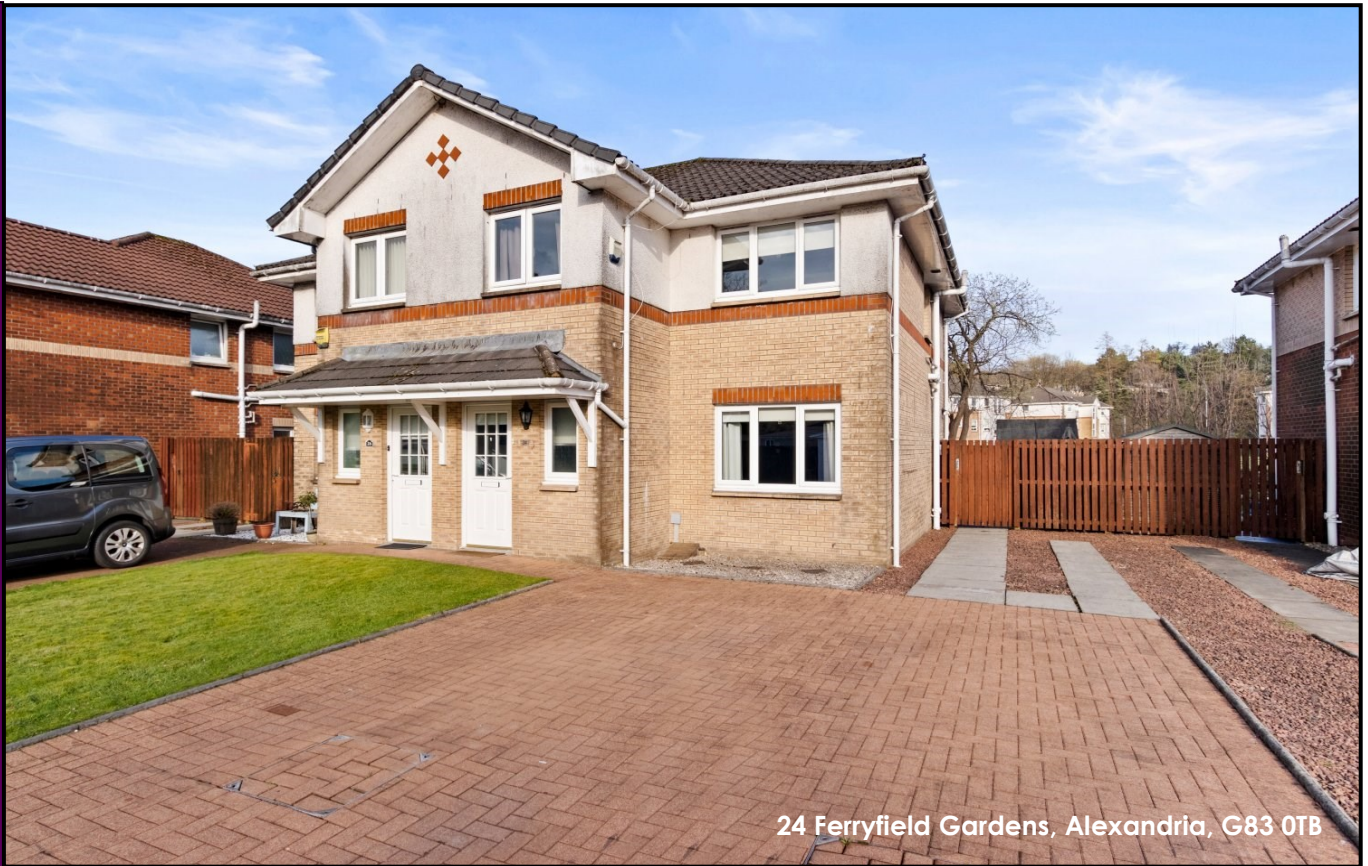
24 Ferryfield Gardens, Alexandria, G83 0TB

Introducing to the market this immaculately presented three-bedroom semi-detached villa set within this much sought after modern development built by renowned builders Turnberry Homes. Tastefully decorated throughout and presented in excellent condition this home is sure to generate high levels of interest and viewing is highly recommended.